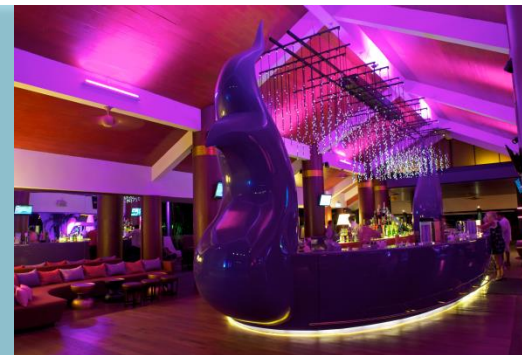
SANOOK BAR Alfresco main bar