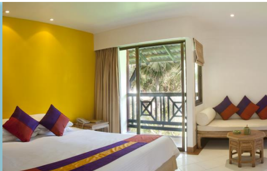
CLUB ROOM with Balcony