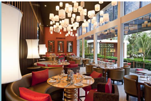
CHU-DA Specialty Restaurant