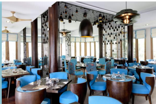
MAMUANG Main Restaurant