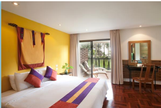
DELUXE ROOM with Terrace / Balcony