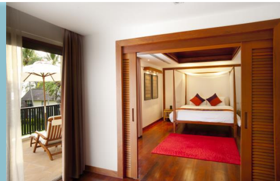
SUITE with Balcony